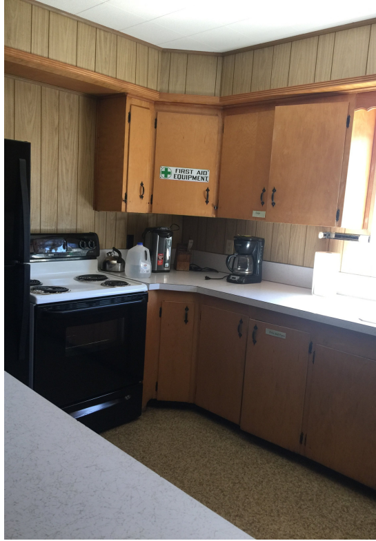
Kitchen before, April 2020.