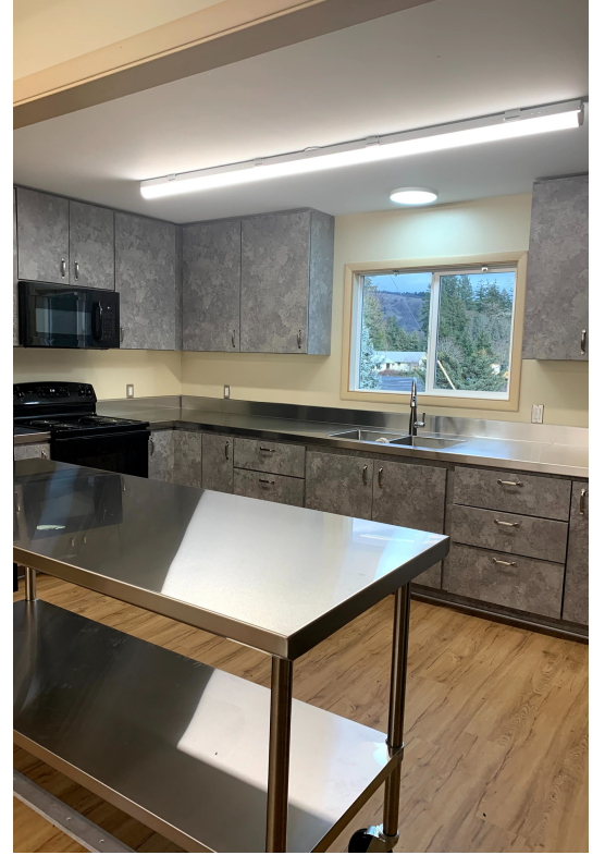
Kitchen after, January 2021.